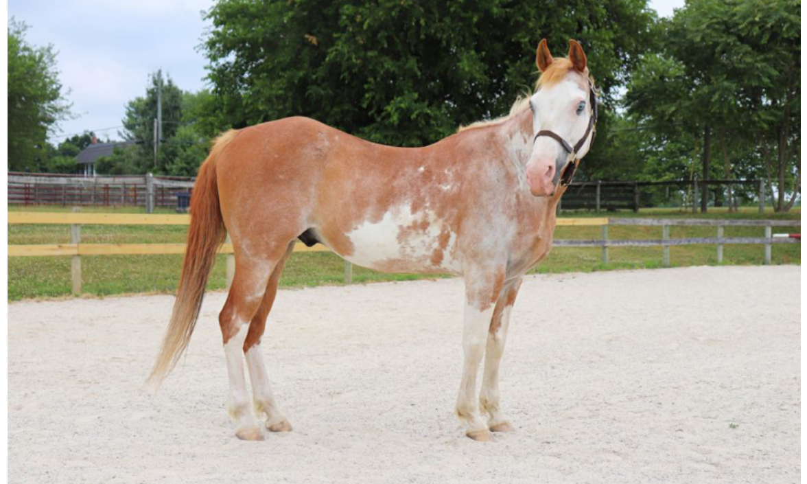
21-year-old Paint gelding, 14.3hh

Ivery Isle is an absolute gentleman and a barn favorite thanks to his quiet, cuddly personality. A lover of treats, he will sniff them out even if you feel you've hidden them well. Ivery enjoys his carrot stretches so much that he'll proactively offer his nose to his flank in an attempt for more snacks.