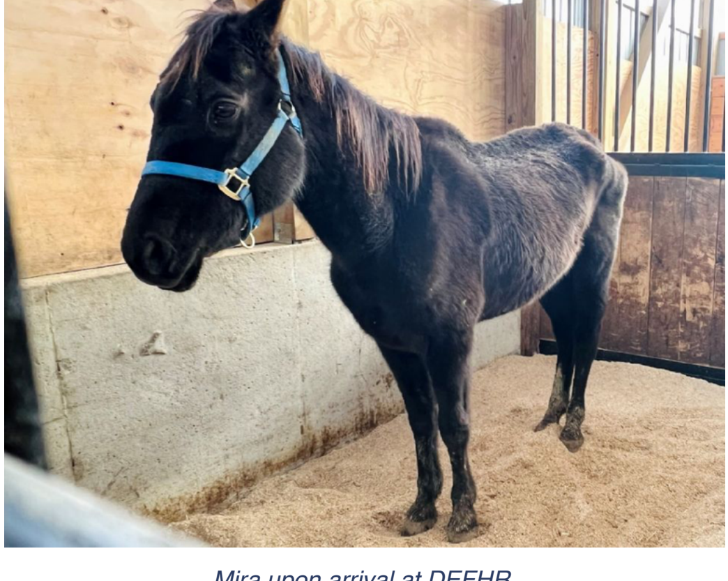
Mira upon arrival at DEFHR.

Mistletoe Miracle, known as Mira in the barn, came to DEFHR in December 2021 after being seized by animal control officers due to severe neglect. She was extremely emaciated when she arrived, scoring a 1 out of 9 on the Henneke Body Condition Scale. Mira made a miraculous recovery and is now healthy and thriving.